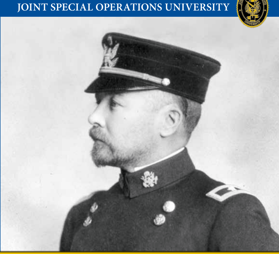
Volume One of a Three-Part Theory Series