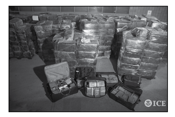
Figure 4. Seized drugs from a sophisticated smuggling tunnel from Tijuana, Mexico to Otay Mesa, California.

In the Middle East, the non-state military group Hamas at one time possessed over 500 tunnels spanning the Egyptian and Israeli borders, including