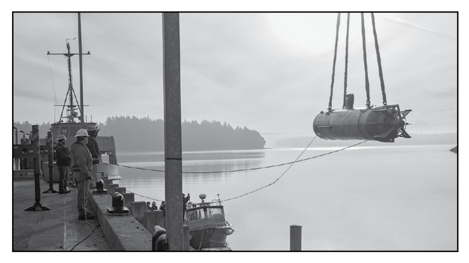
Figure 3. Members of Submarine Development Squadron Detachment 5 (SUBDEVRON 5 Det.) Unmanned Undersea Vehicle (UUV), Keyport Undersea Warfare Center, and Penn State University lower SUBDEVRON 5 Det. UUV's first UUV LTV-38 into the water to conduct its first in-water training.

The U.S. Navy is developing UUVs for missions centered mainly on reconnaissance and expanding maritime domain awareness. UUVs will also be increasingly used for dangerous missions such as countering adversary naval mines. As with unmanned vehicles in other domains, the Navy foresees using unmanned vehicles for "dull, dirty, dangerous, and distant" operations, freeing up manned platforms to perform higher-complexity missions.<sup>61</sup> Logistics operations are almost never mentioned as possible roles for UUVs.