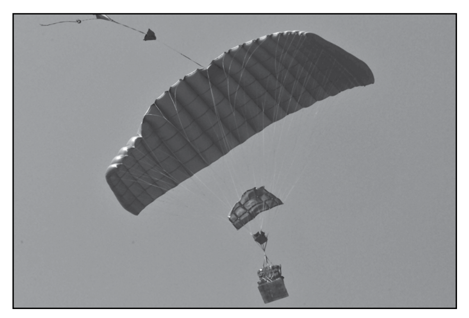
Figure 2. A JPADS guides itself to the ground following its drop from a C-130 aircraft at Normandy Drop Zone in Fort Bragg, North Carolina.

Research to improve the JPADS concept continues. Planned refinements to the concept include further improvement in accuracy (rooftop landings to be regularly achieved by 2020), reduced costs for JPADS units, and reducing or eliminating the reliance on GPS telemetry for aerial delivery operations in denied areas.<sup>51</sup>