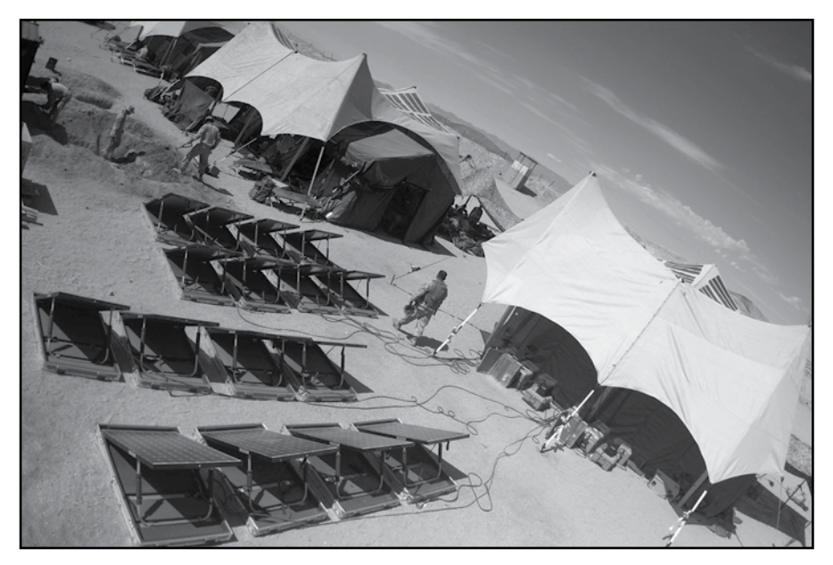
Figure 5. Marine Corps solar energy equipment undergoing testing at Marine Corps Air Ground Combat Center, Twentynine Palms, California.

a SOF detachment at a small expeditionary camp, Natick has also developed small, foldable, and man-portable PV arrays suitable for recharging requirements on foot-mobile operations.<sup>84</sup>