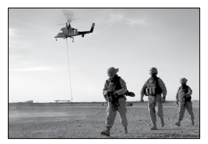
Figure 1. U.S. Marines with Combat Logistics Battalion 5 return from familiarizing themselves with the downward thrust of a K-MAX unmanned aerial vehicle during initial testing in Helmand province, Afghanistan.

and reserve helicopters for only the most critical and emergency missions involving (generally) the evacuation of personnel from access-denied UWOAs.