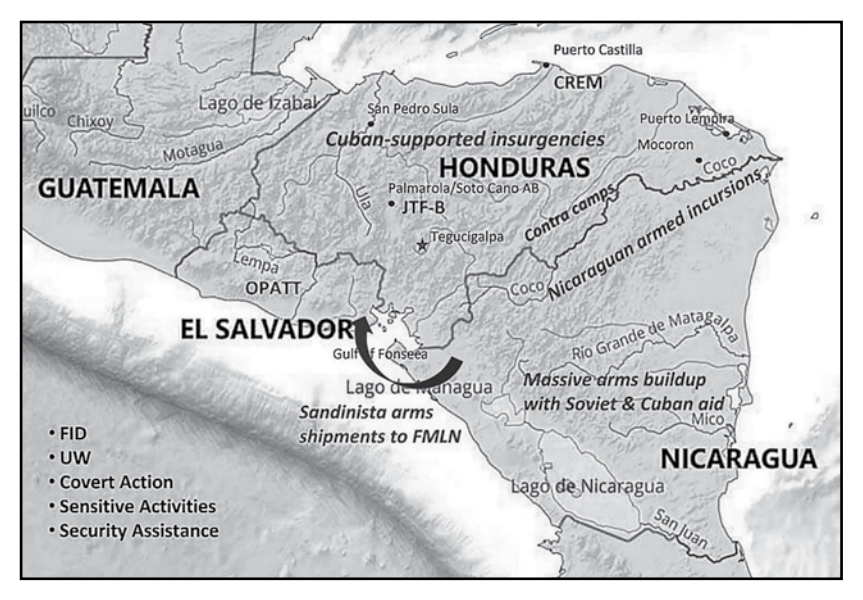
Figure 2. A map showing the Central America irregular warfare campaign.

them that gaining immediately actionable intelligence through the humanitarian interrogation of prisoners produced much better results.