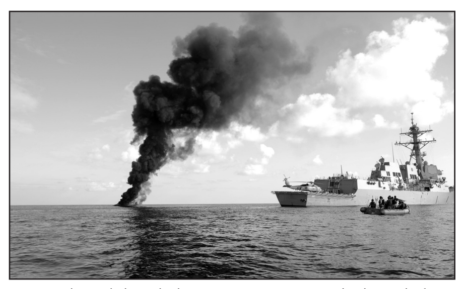
Figure 2. The guided missile destroyer USS Faragut passes by the smoke from a disabled pirate skiff. USS Faragut is part of Combined Task Force 151, a multinational task force established to conduct anti-piracy operations in the Gulf of Aden.

Once on the deep waters the counter-piracy mission transfers to the Combined Maritime Force (CMF), and Combined Task Force (CTF) 151 in