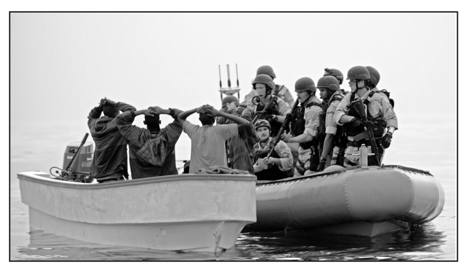
Figure 5. A visit, board, search, and seizure team from guided-missile cruiser USS Anzio investigates a suspected pirate skiff.

As a counter move, the U.S. has started offering very large rewards for the capture of specifically identified leaders of al-Shabaab also known as Harakat Shabaab al-Mujahidin. In a formal announcement, the DOS noted, "The al-Shabaab organization's terrorist activities pose a threat to the stability of East Africa and to the national security interests of the United States."<sup>202</sup>