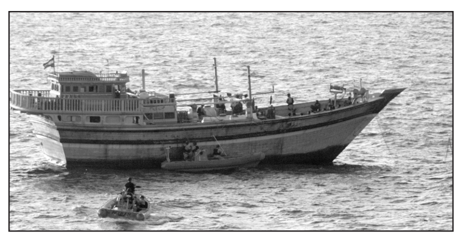
Figure 4. A visit, board, search, and seizure team assigned to guided-missile destroyer USS Kidd board the Iranian-flagged fishing dhow Al Molai. The team detained 15 suspected pirates, who were holding a 13-member Iranian crew hostage for several weeks.

is peril in comparing them to Barbary brigands. That muddies the debate—clouding our perspective on what truly is in our national interest." <sup>183</sup>