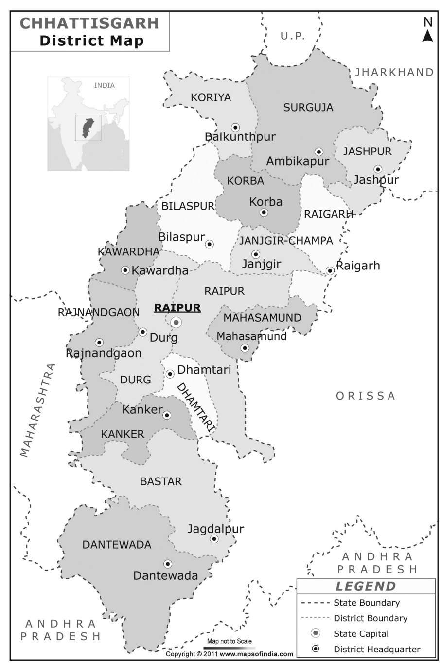
Figure 5. District of Chhattisgarh.