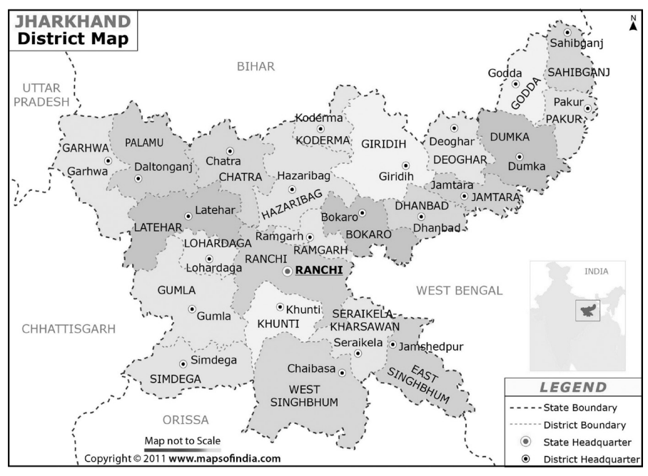
Figure 6. District of Jharkhand. Map used by permission of Maps of India.