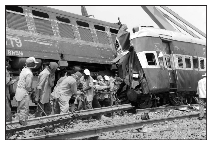
Figure 8. Trains are a favorite target of Maoists.

by the Maoists, which led to 217 disruptions in the movement of trains and cancellation of 416 trains.