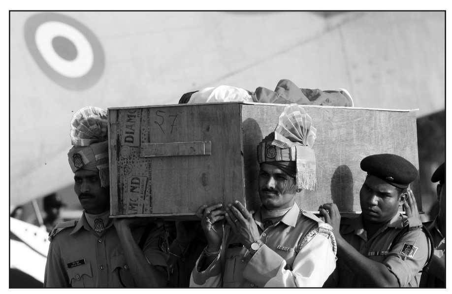
Figure 4. Central Reserve Police Force officials carry the coffins of Indian police officials who were killed during an ambush by Maoist guerrillas.

The year 2008 continued to witness intensified Naxalite violence: the ultras attacked Nayagarh town in Orissa on 15 February and overran three police stations, killing 13 policemen and 2 civilians. They also decamped with 1,100 weapons, though police were able to recover about half of them; on 29 June, 35 security forces personnel belonging to the Greyhounds (elite anti-Naxal force) of Andhra Pradesh police were killed/drowned in an attack on a combined group of Andhra and Orissa police in the Chitrakonda