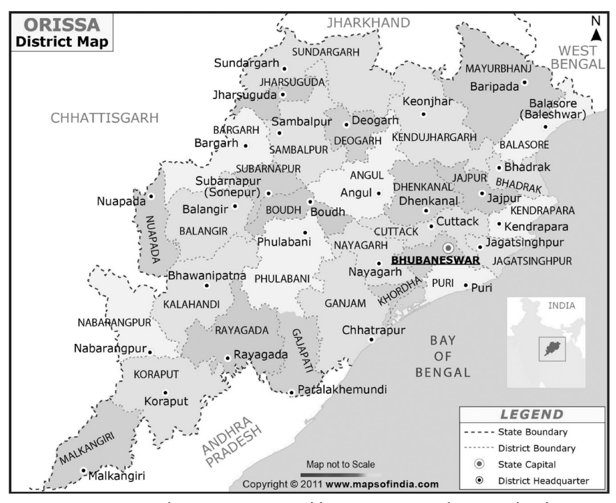
Figure 3. Districts of Orissa. Map used by permission of Maps of India.

In Madhya Pradesh, the districts of the Chhattisgarh region, namely Raipur, Durg, Bastar, Bilaspur, Sarguja, and Raigarh were affected. Party cells were formed in these districts under the guidance of Jogu Roy, the CPI (ML) leader of the region. Members of tribes in Bastar area were particularly receptive to Naxalite propaganda as they nursed a feeling of neglect by the state government. Naxalite posters could be seen in Jagdalpur, the district headquarters.