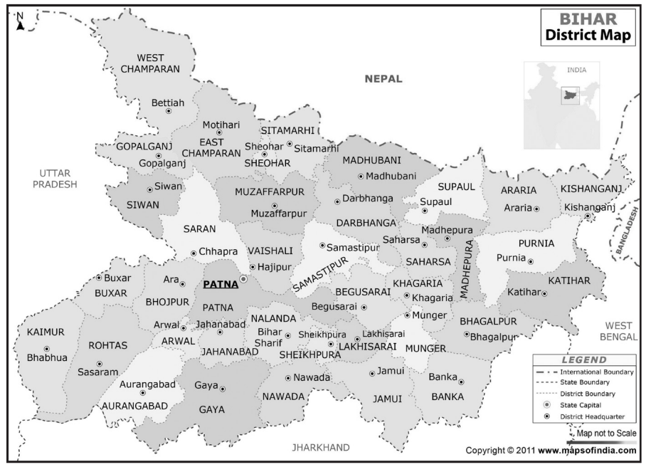
Figure 2. Districts of Bihar.

In the early stages, Naxalite activities in the area were confined to three villages with Gangapur as the center. In April 1968, the peasants of Gangapur harvested the arahar (a kind of lentil) crop of the landlord in broad daylight. This was the starting point of trouble. Retaliation was quick. Bijli Singh, the zamindar (landlord) of Narsinghpur, organized an attack on the peasants with 300 men armed with lathis (sticks), spears, swords, daggers, and firearms. The landlord himself came on an elephant and brought two cartloads of stones. A bizarre fight followed and it went on for about four hours. The landlord and his hoodlums eventually fled.