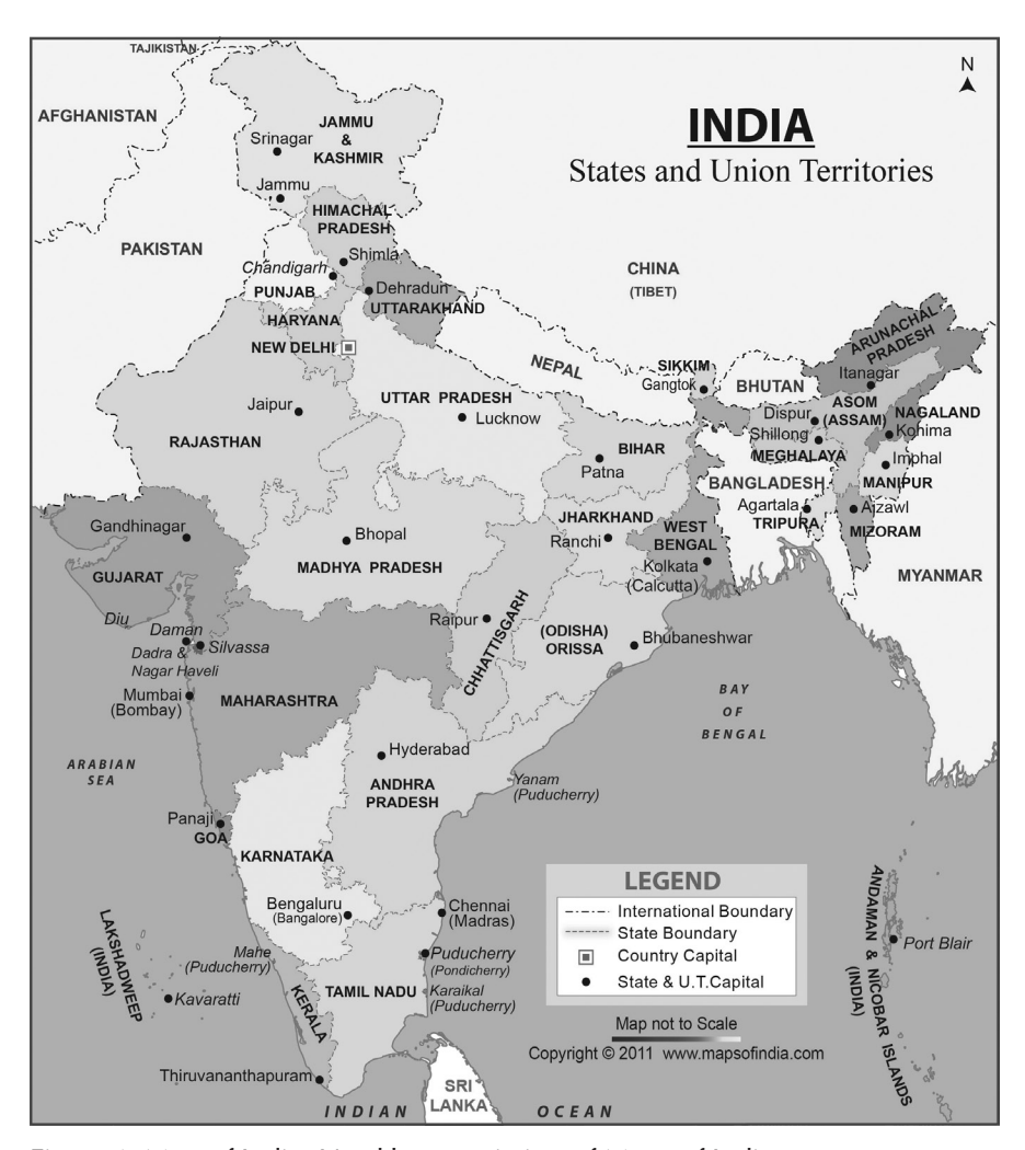
Figure 1. Map of India. Used by permission of Maps of India.

This monograph seeks to provide a concise but thorough history of this movement, and the government's response, from the movement's inception to the present day.