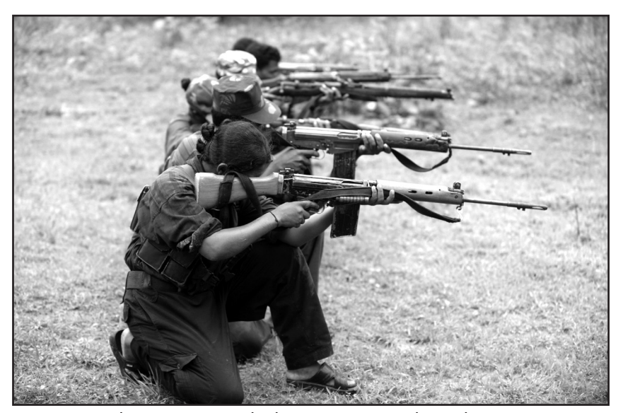
Figure 10. Indian Maoists ready their weapons as they take part in a training camp in a forested area of Bijapur District in Chhattisgarh.

Kobad Gandhi were released from custody. In a gesture of one-upmanship, Maoist leader Kishenji said on 17 August 2010 that they were prepared for peace talks on the condition that the government agreed to a three-month cease-fire and a judicial probe into the death of Maoist leader Azad, who was killed in an encounter with the police on 2 July 2010. The government rejected the offer on the ground that they had not received any formal communication from the CPI (Maoist) nor had the ultras abjured violence. The government blamed the Maoists for trying to "create confusion and buy time for themselves amid an intense offensive against them from security forces."85