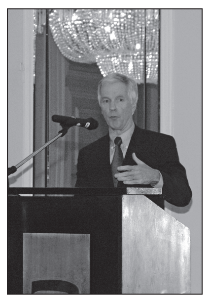
Ambassador Ryan Crocker

Ambassador Crocker centered his comments on that essential requirement for cooperation within the United States government and with other nations, intergovernmental organizations (IGOs), and nongovernmental organizations (NGOs). He drew linkages with the EPIC visit earlier in the day and said, "I like the Sovereign Challenge title" and the "unique opportunity to exchange views and perspectives among yourselves." He affirmed the shared concern for nonstate actors challenging sovereign states resulting in transformational threats that require transformational responses. These threats are