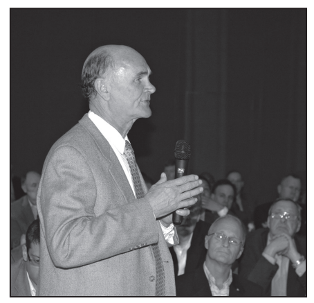
Honorable John F. Cook

Given the high murder rates in Ciudad Juarez (some 6,000 during the past 2 years), attendees were interested in how El Paso could be considered the second safest major city of its size in the U.S. with only five murders in the past 2 years. ( Note: shortly after the conference, El Paso was named the safest city of its size.) The mayor suggested that the number of local, state, and federal agencies and the respect the public has for their competence and