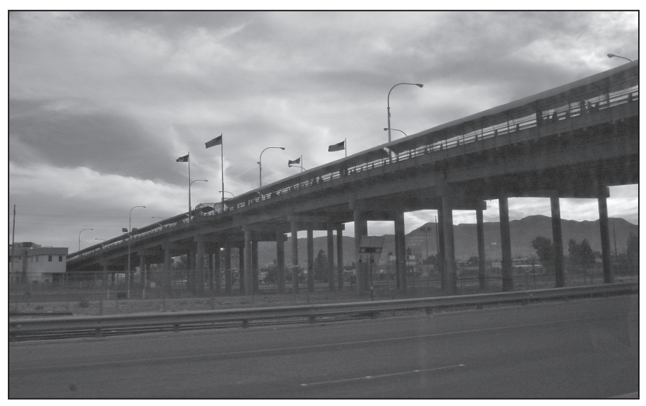
Pedestrian bridge from El Paso to Ciudad Juarez