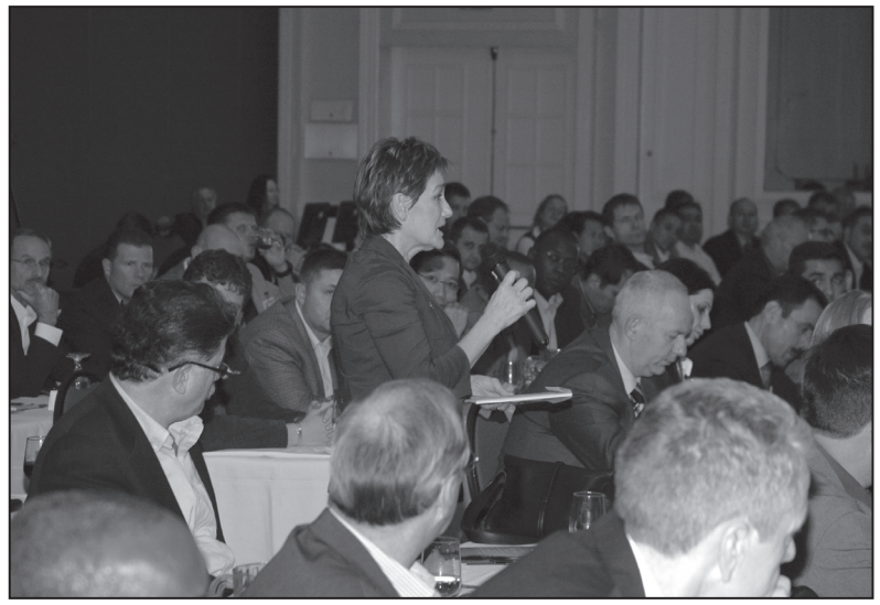
Question from the floor