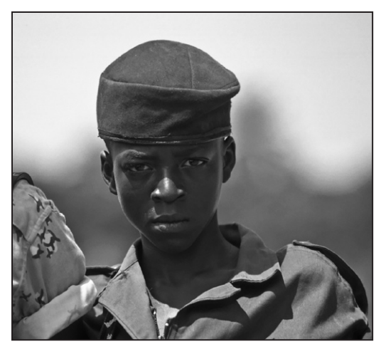
A child soldier of the DR Congo.

Council admonishment pressuring them to stop using child soldiers. 186 The Coalition to Stop the Use of Child Soldiers recently reported that children were engaged in armed conflict in 19 countries. The African countries listed were Burundi, Central African Republic, Chad, Côte d'Ivoire, the Democratic Republic of Congo, Somalia, Sudan, and Uganda. In addition to combat, these children are also used as spies, informants, and messengers. The