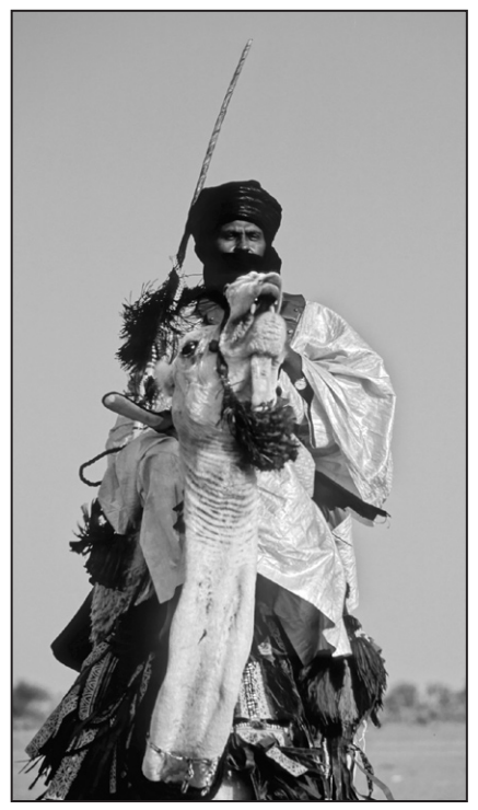
Above, a Tuareg on the move; below, close-up of a Tuareg guide.

General repression of the Tuaregs was exacerbated by repeated droughts in the 1970s and 1980s, which forced changes in traditional migration routes. Those changes brought the Tuaregs into conflict with other groups that lived in more stationary, even urbanized, settings. Those droughts also weakened the central governments of several countries. Barely able to cope with local economic problems, the governments did little to assist in the plight of the Tuaregs. This led to a movement by some Tuareg leaders to call for autonomy. To that end, the Popular front for the Liberation of Niger (FPLN) was formed. In May 1990, with grievances escalating, the FPLN attacked a police station in Tchin-Tabaradene. In response the Nigerien military arrested, tortured, and killed several hundred Tuareg civilians there and in nearby cities in what became known as the Tchin-Tabaradene massacre and led to more than five years of open conflict.121 The conflict expanded to Mali and continued until peace accords were signed in 1995.122