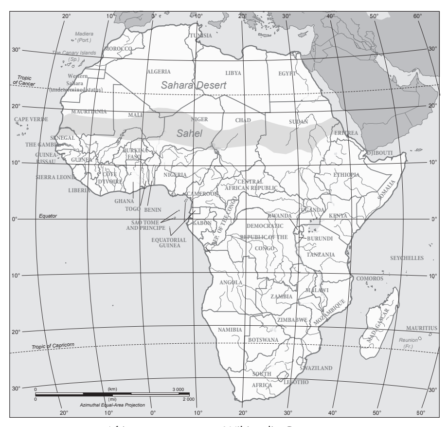
Africa, map courtesy Wikipedia Commons.

At the same University of Southern California conference, an ambassador assigned to AFRICOM stated that the existence of the new command was "an acknowledgement for the growing strategic importance of Africa." <sup>4</sup> In the dinner speech it was also noted that American emphasis would be larger than humanitarian assistance, which frequently has been required for decades of both natural and human generated disasters. The American objective would be to support the African Union as it continues to develop. The oft-used buzzwords infer that we need to help African nations build capacity —a concept never really defined.