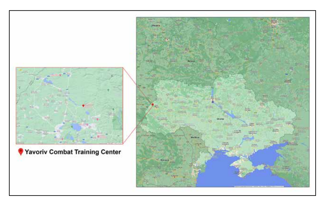
Figure 1. Special Operations Forces Training Areas in Ukraine.

Xi has the benefit of observing Putin's Ukraine strategy and adjusting China's Taiwan strategy accordingly. As Xi surveys the operational delays in Russia's invasion, as well as the compounding logistical complexity such delays have caused, he is likely reminded of a PLA warfighting philosophy: "Strive to catch the enemy unexpectedly and attack him when he is not prepared, to seize and control the battlefield initiative, paralyze and destroy the enemy's operational system, and shock the enemy's will for war."<sup>20</sup>