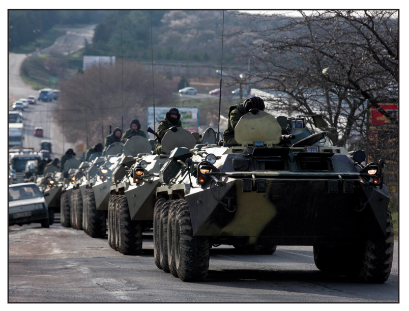
Soldiers, believed to be Russian, ride on military armored personnel carriers on a road near the Crimean port city of Sevastopol on 10 March 2014.

What next? Over the coming decade, the 3rd Offset Strategy might begin yielding technological solutions to today's Anti-Access/ Area-Denial (A2/AD) challenges. For the Australian army, the likely