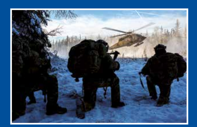
U.S. Air Force special operations soldiers prepare to conduct operations in the Arctic region.

We find ourselves at the start of a new era characterized by long-term strategic competition with revisionist powers. It is clear that we need to think hard about what competition is and what Special Operations Forces (SOF) require to address it. In On Competition: Adapting to the Contemporary Strategic Environment, we explore what competition means and outline a practical approach, bridging theory with practice. Competition is a consistent, natural occurrence across the history of human civilization. In the current and future security environment, states such as China, Russia, and Iran and non-state actors alike have new tools that allow them to pursue their interests in ways that undermine the existing international order and institutions.