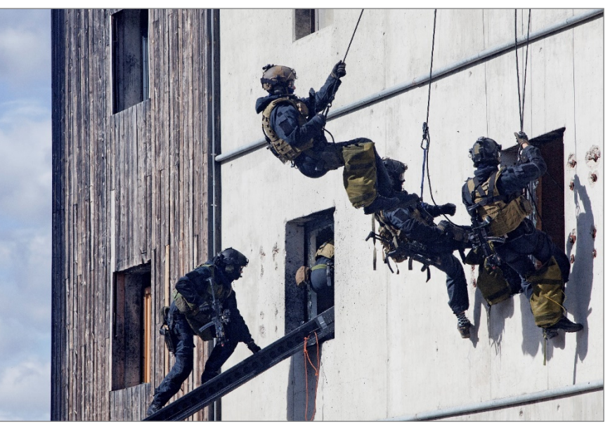
Close quarters battle training, 2012, at the NORASOC training site, Rena military base, Hedmark, Norway.

The long-term relationships created during the interactions of agents and commandos during the Second World War never ceased to grow and develop. The networks continued to expand, culminating in the current fights in Afghanistan and Iraq. where this multi-faceted network of professionals has proven its value to military, civilian, and political leaders. The trust that has been built within