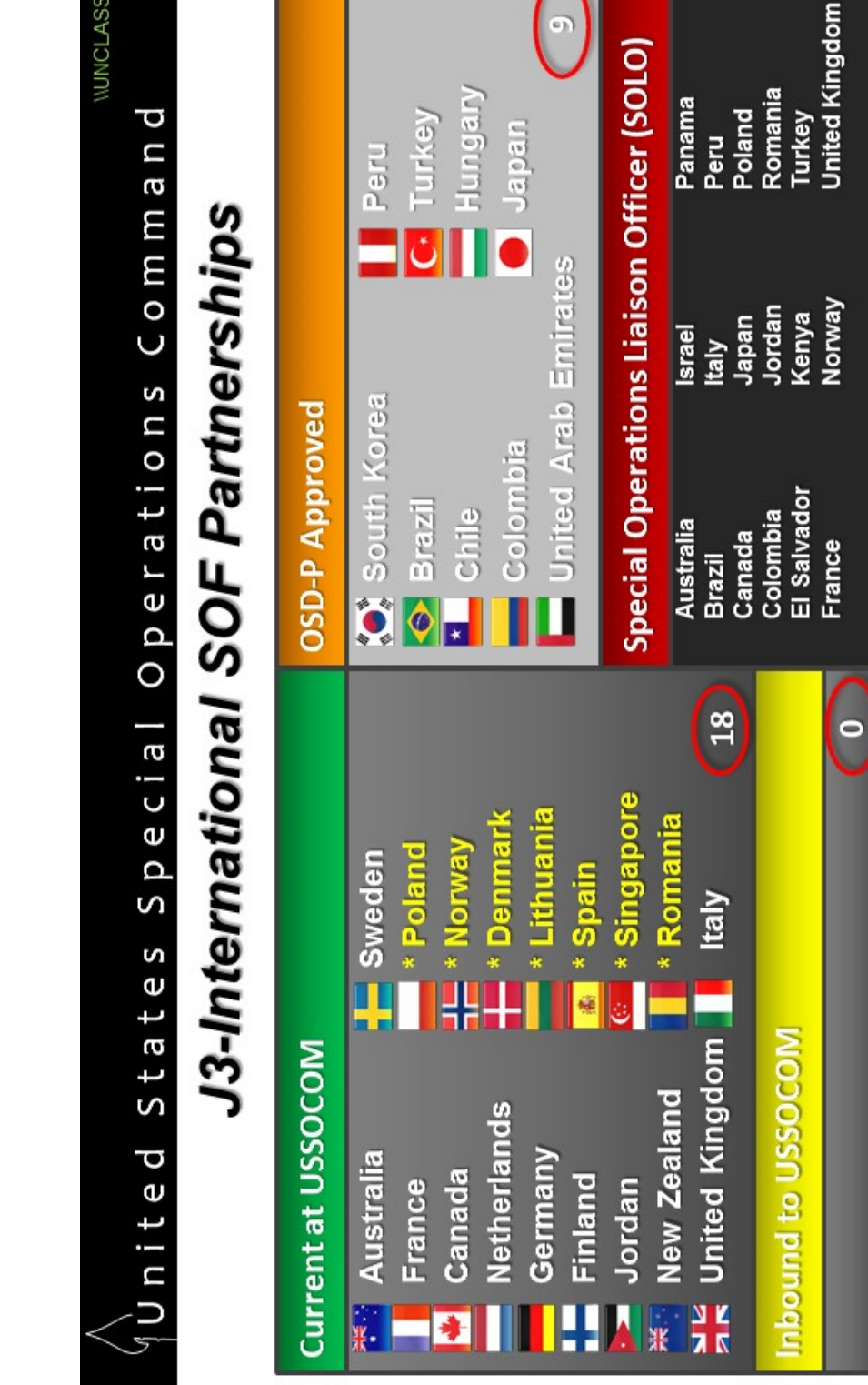
Figure 2: The Growth of SOF Partnerships within SOCOM<sup>43</sup>

Total Present upon completion of current OSD-approved negotiations: <u>27 Nations</u>