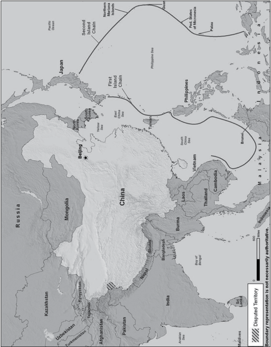
Figure 2. The First and Second Island Chains. Source: Annual Report to Congress: Military and Security Developments Involving the People's Republic of China 2011.