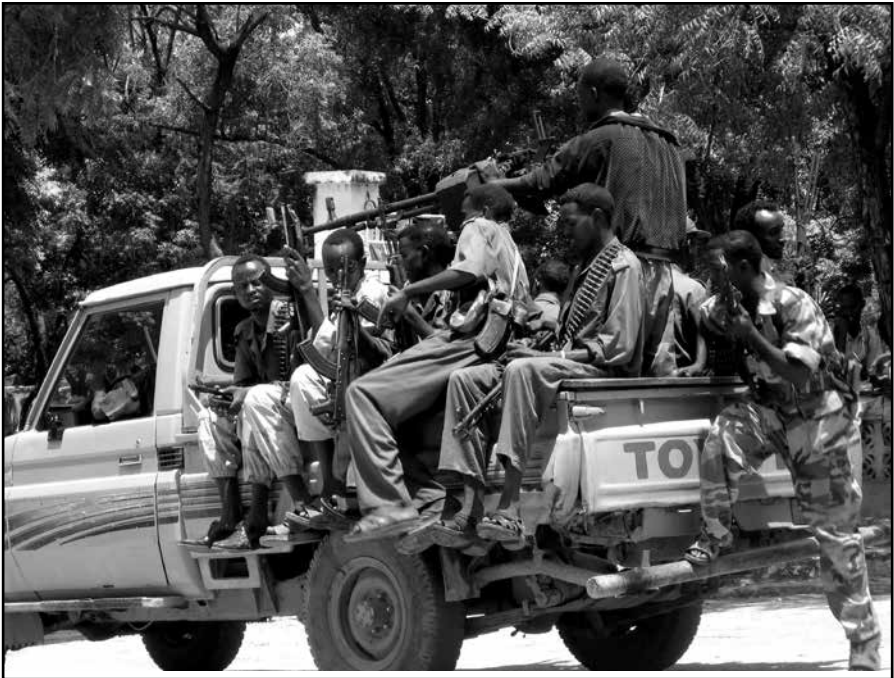
Figure 2. TFG soldiers patrol Mogadishu.

that AMISOM had used unnecessary force and targeted heavily populated quarters and markets far away from the fighting area(s) which can only be taken as deliberate mass killing. Since AMISOM had not come with the consent of the Somali people, lately we have been spending a significant amount of time and efforts to convince our people to accept AMISOM as a peace keeping force, but the latest terror has seriously damaged the image of the mission of AMISOM in Somalia ... We consider this AMISOM action as a war crime; therefore we urgently request the UN as well as AU to send an impartial fact find [sic.] mission at the earliest possible time to investigate these atrocities and swiftly bring the culprits to justice. 26