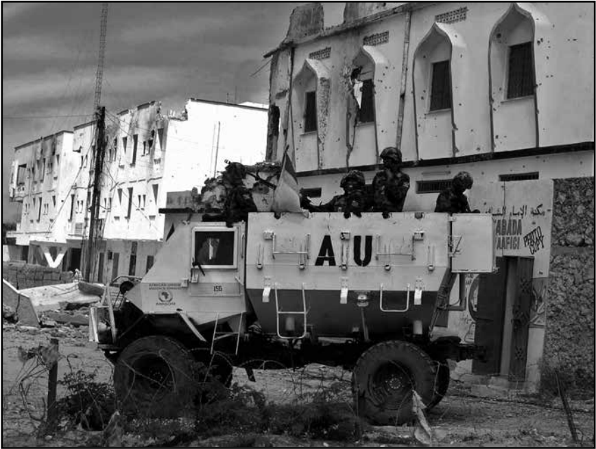
Figure 4. AMISOM patrol.