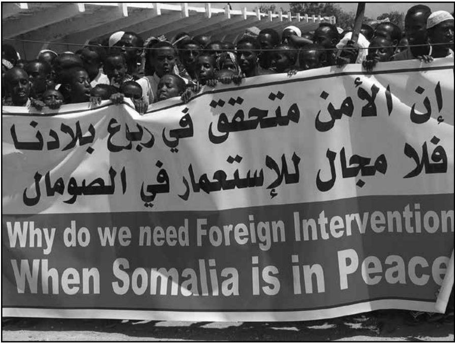
Figure 1. Demonstrators in Mogadishu protest foreign interference.

on Villa Somalia and the port. But the Ethiopian army stayed in Mogadishu and remained the visible guarantor of the TFG's safety, patrolling the city's streets. Ethiopian soldiers were accused of committing a wide range of atrocities, including firing mortars on civilian hospitals, press institutions, and houses, and rape, theft, kidnapping, and murder of Somali civilians. 15