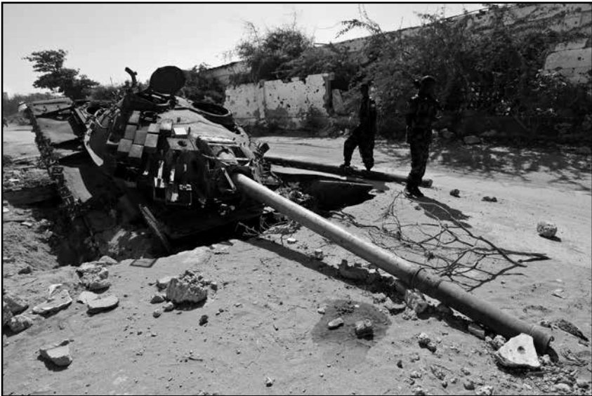
Figure 6. AMISOM soldiers stand near a burnt out AMISOM tank in Mogadishu.

This period also saw AMISOM occasionally forced to conduct vicious street-fighting with enemy forces sometimes less than 50 meters away from its positions. Al-Shabaab's fighters tended to traverse the city in small units of 10 or so fighters, but its network of underground tunnels also meant that it could mass a significant force—of up to 100 fighters—very quickly when peacekeeping patrols were spotted in the city. AMISOM's indirect fire weapons were thus often used danger close, i.e. within the minimum safety distances for AMISOM troops as well as any present civilians. Tunnels and pit traps were also used by al-Shabaab to snare AMISOM tanks and armored vehicles. 160