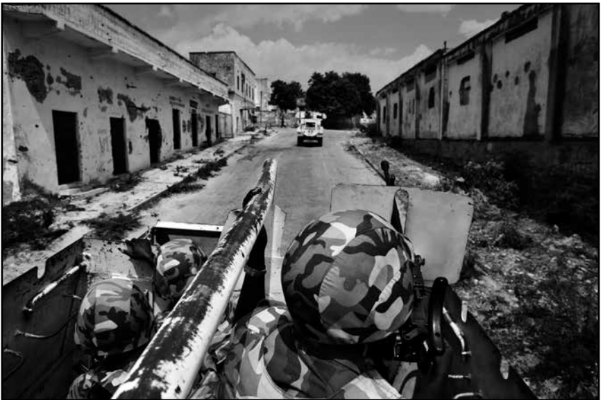
Figure 5. AMISOM on patrol, Mogadishu.