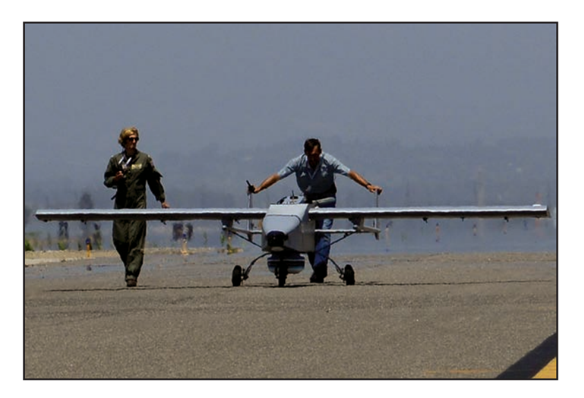
An unmanned aircraft system is seen on the flightline at Naval Base Ventura County and Sea Range, Point Mugu, California, on 31 July 2015. The UAS was part of Black Dart 2015, a DOD-sponsored demonstration that included industry personnel and participants from four military branches to assess and improve technologies, tactics, and techniques used by the DOD and its partners in countering the threat of UAS.

Active defenses are the final layer of defense-in-depth and include two defense measures; destruction. interruption or Interruption can be conducted in several ways, including signal operator interruption, spoofing, signal jamming, malicious code insertion, packet spoofing, and network protocol exploits.<sup>32</sup> Operation interruption involves identifying the sUAS operator, and either requesting or compelling the operator to cease operations. Signal jamming involves overwhelming command and control (C2) signals of the sUAS. Most sUAS are controlled via RF or IEEE 802.11 Wi-Fi