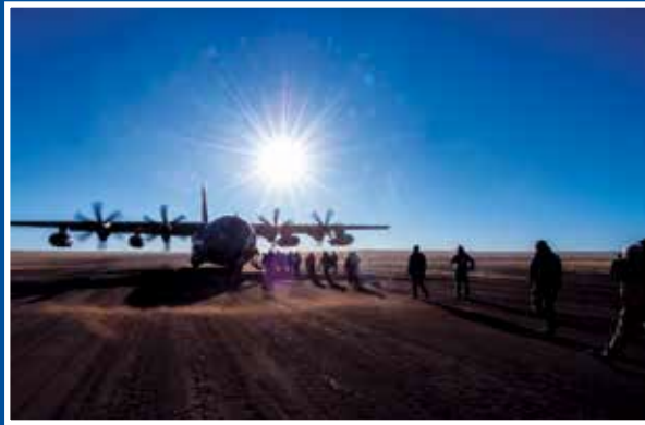
Members of the Civilian Leadership Development Program receive a demonstration of Special Operations Forces capabilities at Melrose Air Force Range, New Mexico, 30 January 2019.

The JSOU Special Operations Research Topics 2020 publication highlights a wide range of topics collaboratively developed and prioritized by experts from across the Special Operations Forces (SOF) community. As with the previous versions of this publication, this list is tailored to address special operations priorities. The topics in these pages are intended to guide research projects for professional military education (PME) students, JSOU faculty, fellows and students, and others writing about special operations during this academic year. This research will provide a better understanding of the complex issues and opportunities affecting the strategic and operational planning needs of SOF.